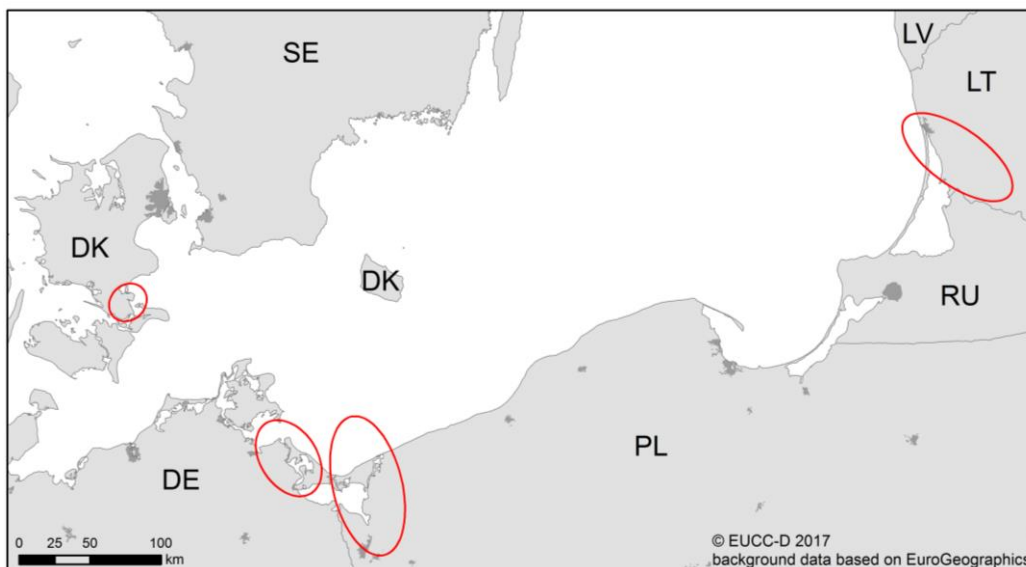
Fig. 1: CATCH case studies in the South Baltic Region

Within the CATCH project regional networks are developed based on case studies to increase the capability of stakeholders to engage in the topic and to develop and strengthen interfaces to further topics of regional development, such as other economic branches or tourism sectors. Thus, significant spill-over effects can be expected and further synergies are conceivable. For this purpose various target groups will be linked in stakeholder body groups. The stakeholder body groups initiated by the partnership work together on regional, national and cross-border level (Lithuania, Poland, Germany and Denmark) to raise awareness of this new trend and to discuss possibilities and feasibilities for establishing sustainable angling sites. The exchange of experiences and best-practice between different stakeholder groups and existing angling sites will help to work jointly on guidelines for other coastal municipalities to develop sustainable angling tourism boosting coastal development.